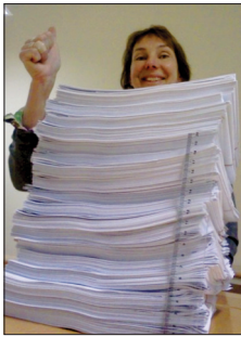
Figure 1: Paperwork required for regulatory review of the research described in panel 1